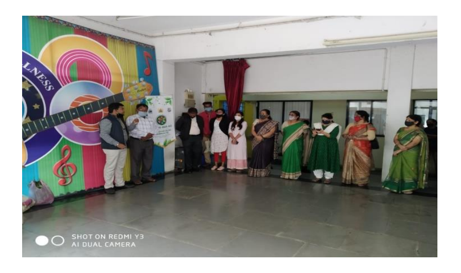
Project Co-ordinator, NGC address the staff regarding Harit Diwali-Swasth Diwali celebration