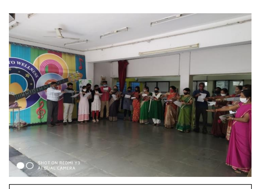
Oath taken by staffs of MLA College and NGC team regarding Diwali